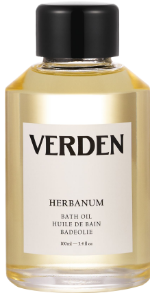
Full Bath Oil 100ml - 3.4 fl oz