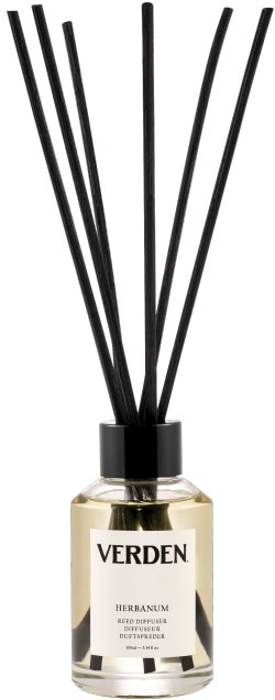
Full Reed Diffuser 100ml - 3.4 fl oz