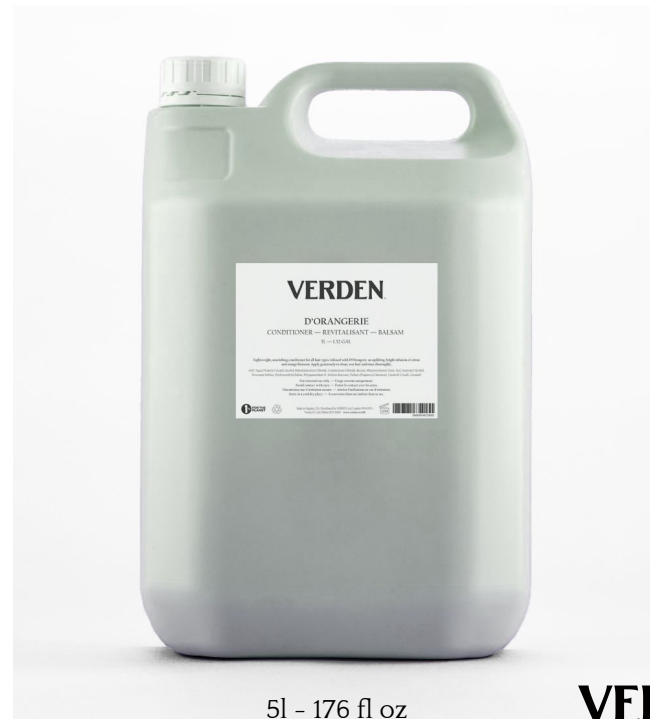
5l - 176 fl oz