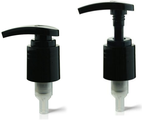
Lock Down Pump for 500ml Bottles

For 500ml Empty Bottles and 5l Refill Jugs