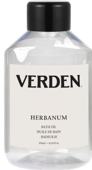
Empty Bath Oil Bottle 300ml - 10.14 fl oz