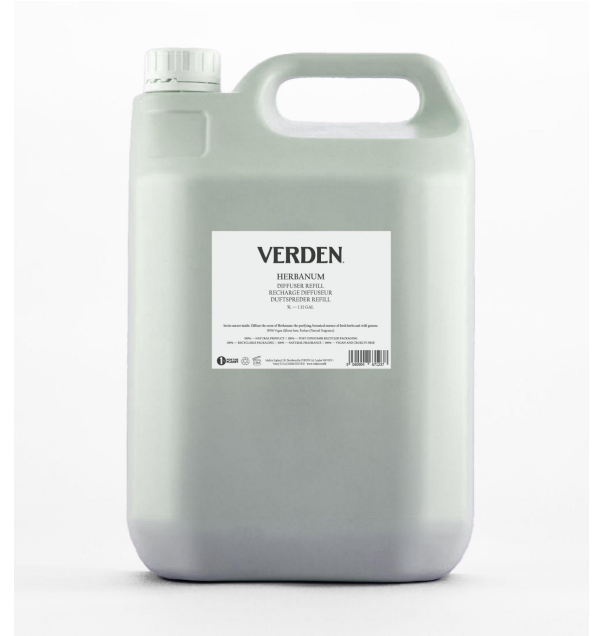
Diffuser Fill 5l - 176 fl oz