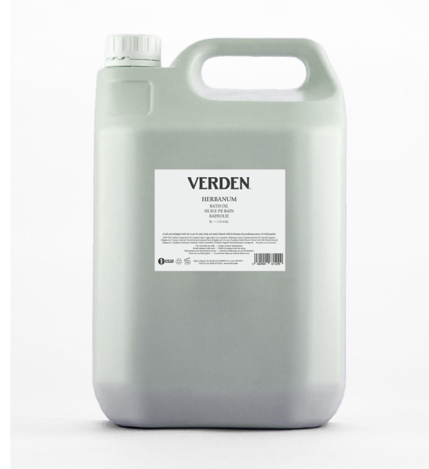
5l - 176 fl oz