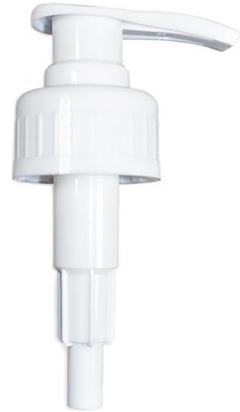
Pump for 5l Refill Jugs