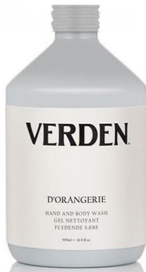
EMPTY 500ml - 16.9 fl oz