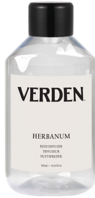
Empty Reed Diffuser Bottle 300ml - 10.14 fl oz