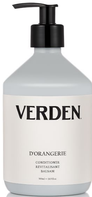
FULL 500ml - 16.9 fl oz

Lightweight, nourishing conditioner for all hair types.